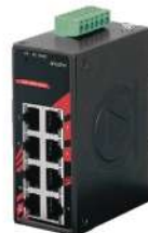
LNX-C800G 8-Port Compact Industrial Gigabit Unmanaged Ethernet Switch