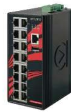
LMX-1600G 16-Port Industrial Gigabit Light Layer 3 Managed Ethernet Switch