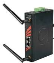
AMS-7131 Industrial IEEE 802.11a/b/g/n WiFi Access Point/Client/Bridge/Repeater