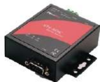
STE-501C 1-Port RS232/422/485 to Ethernet Device Server