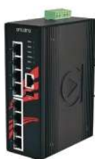
LMX-0800 8-Port Industrial Light Layer 3 Managed Ethernet Switch