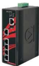
LMX-0500-V2 5-Port Industrial Light Layer 3 Managed Ethernet Switch