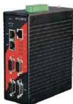
STE-6104C-T 4-Port Industrial Serial RS232/422/485 to Ethernet Device Server with Dual LAN