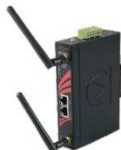
ARS-7235-AC Industrial IEEE 802.11a/b/g/n/ac Wireless Router/Access Point/Client/Bridge/Repeater