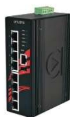
LMX-0800G 8-Port Industrial Gigabit Light Layer 3 Managed Ethernet Switch