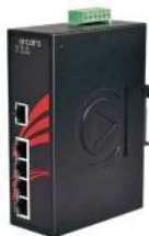
LNP-0500-24 5-Port Industrial PoE+ Unmanaged Ethernet Switch; 12-36VDC