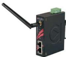
AMS-2111 Industrial IEEE 802.11b/g/n Wireless LAN Access Point/Bridge/Client/Repeater