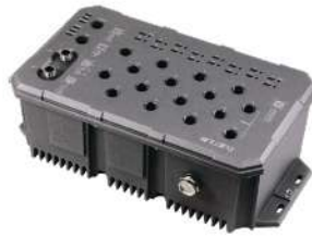
LMP-1600G-M12-67-110(-T) 16-Port Industrial M12 IP67 Waterproof Gigabit PoE+ Light Layer 3 Managed Ethernet Switch, with 16*10/100/1000Tx M12 Connectors (X-Coded) (30W/Port); 24~110VDC Power Input