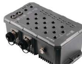
LMX-1802G-M12-10G-SFP-67(-T) 18-Port Industrial M12 IP67 Waterproof Gigabit Light Layer 3 Managed Ethernet Switch, with 16*10/100/1000Tx M12 Connectors (X-Coded) and 2*1G/10G SFP Slots