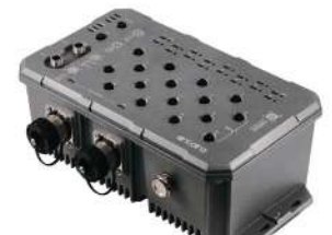
LMX-1802G-M12-10G-SFP-67-110(-T) 18-Port Industrial M12 IP67 Waterproof Gigabit Light Layer 3 Managed Ethernet Switch, with 16*10/100/1000Tx M12 Connectors (X-Coded) and 2*1G/10G SFP Slots; 24~110VDC Power Input