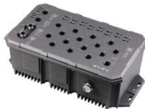
LMX-1600G-M12-67-110(-T) 16-Port Industrial M12 IP67 Waterproof Gigabit Light Layer 3 Managed Ethernet Switch, with 16*10/100/1000Tx M12 Connectors (X-Coded); 24~110VDC Power Input