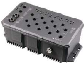
LMX-1600G-M12-67(-T) 16-Port Industrial M12 IP67 Waterproof Gigabit Light Layer 3 Managed Ethernet Switch, with 16*10/100/1000Tx M12 Connectors (X-Coded)