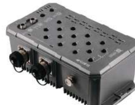
LMP-1802G-M12-10G-SFP-67-24(-T) 18-Port Industrial M12 IP67 Waterproof Gigabit PoE+ Light Layer 3 Managed Ethernet Switch, with 16*10/100/1000Tx M12 Connectors (X-Coded) (30W/Port) and 2*1G/10G SFP Slots; 24~55VDC Power Input