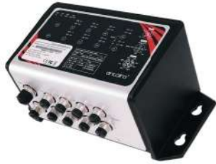
LNP-0800G-M12-67-24(-T) 8-Port Industrial M12 IP67 Waterproof Gigabit PoE+ Ethernet Switch, w/8*10/100/1000Tx (30W/Port) M12 Connectors (X-Coded)